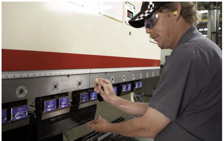
▲ Wilson's Express manual clamping system for press brake tooling eliminates the need to slide punches in from the end of the machine. After the operator loads the tooling into the clamp, spring-loaded clamps capture the punch and hold it in place. The operator locks the tooling in place by pushing the removable lever upward. The system accepts punches up to 16.34 in. (415 mm) long or individual pieces of sectionalized punches.