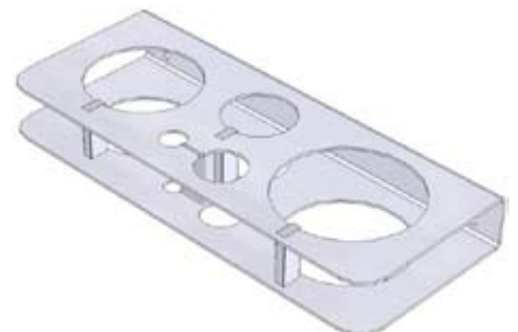
Thick Turret Tightening Fixture