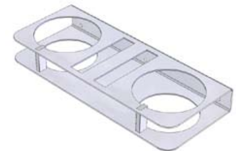
Side Attachment Dual E Station Fixture